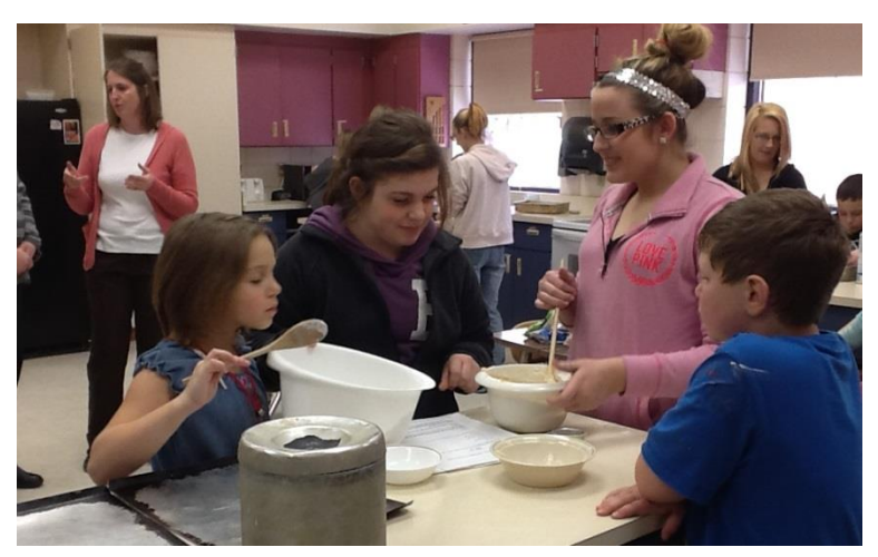
High School students from the Gourmet Foods class working with 3<sup>rd</sup> Graders to learn math skills.